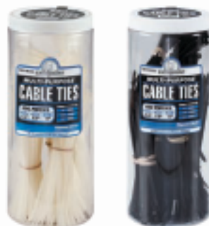
90650 and 90650-UV